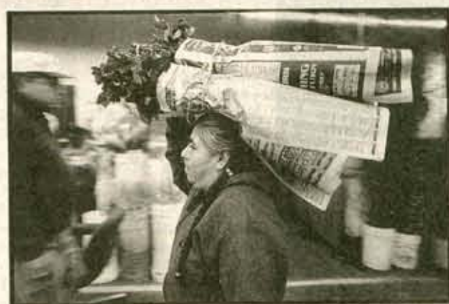
A vendor with her wares at the flower market on Wall Street near 7th. An informal business meeting, below, at Citibank Plaza, 5th and Flower streets.